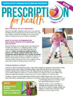
Children's Exercise Guidelines (4 Pages)