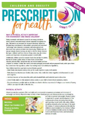
Children and Obesity (4 Pages)