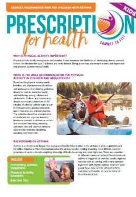
Exercise for Children with Asthma (4 Pages)